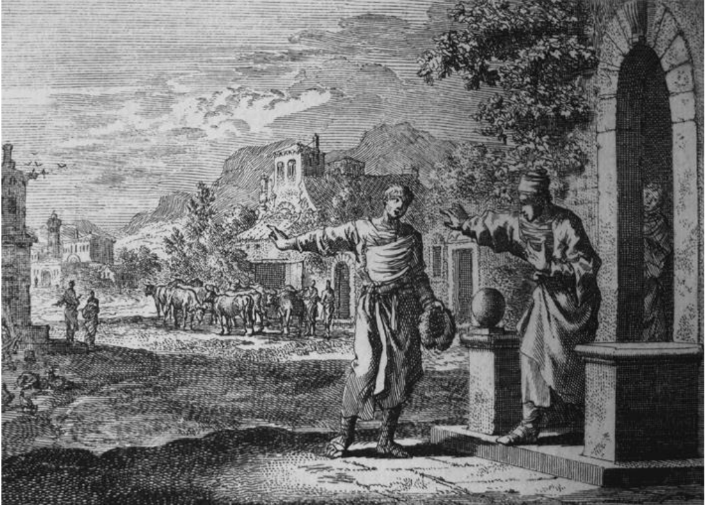
“Invitation to the Great Banquet”

Jan Luyken, etching depicting Luke 14:16-24, published in the Bowyer Bible, Bolton, England, 1840