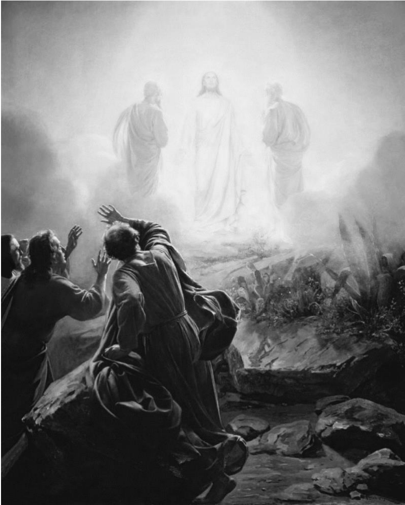
“Transfiguration of Jesus”

Carl Bloch, 1872, oil on copper, Museum of National History, Frederiksborg Castle, Hillerød, Denmark