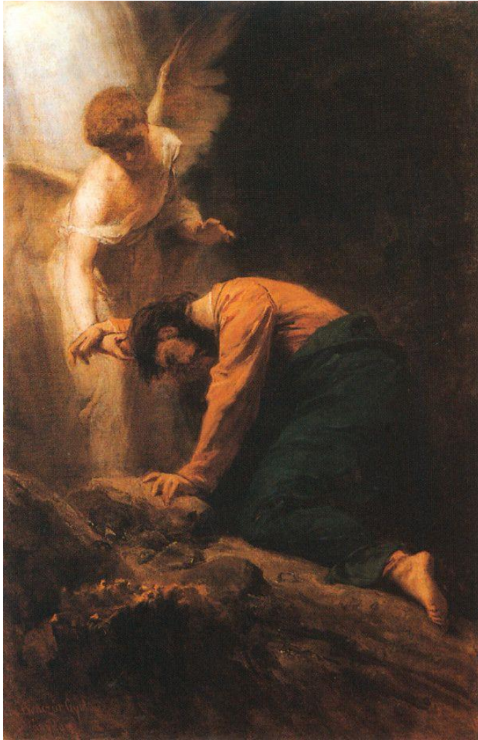
"Christ on the Mount of Olives"

Gyula Benczúr, 1919, oil on canvas, Hungarian National Gallery, Budapest