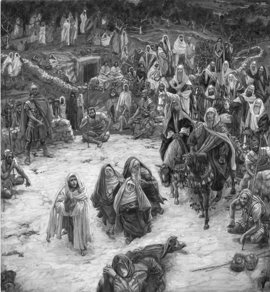
"What Our Lord Saw from the Cross"

James Tissot, ca. 1886-1894, gouache over graphite on gray-green wove paper, Brooklyn Museum, New York